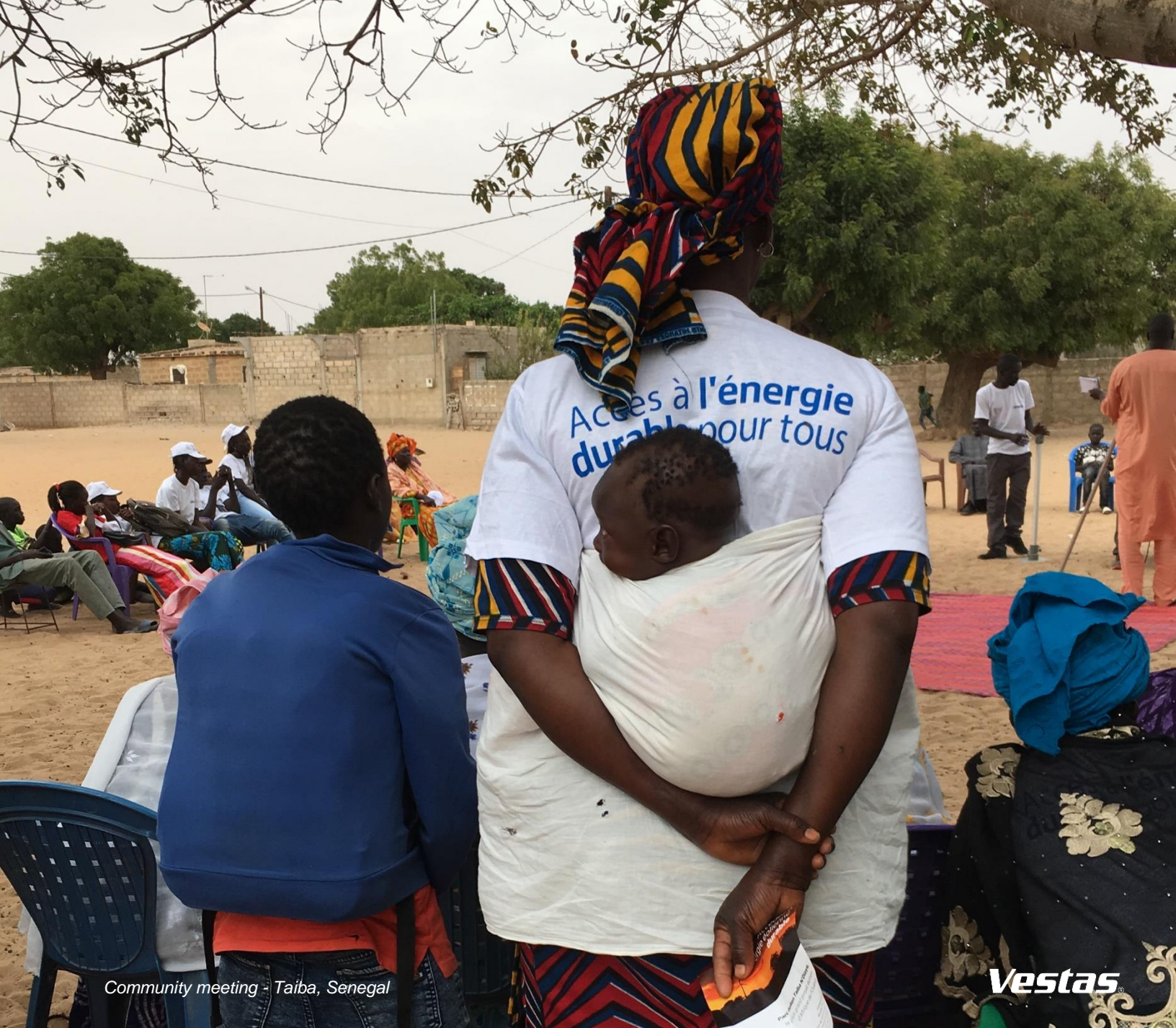
Community meeting - Taiba, Senegal